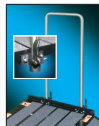
Easily attachable assist handle