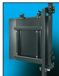
Platform folds and locks for traveling