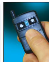
Two convenient wireless remote key fobs