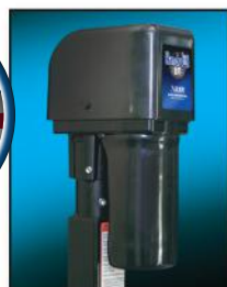
12 Volt Heavy-Duty Motor

CAUTION! Handy Lift is intended to assist a "standing" person (holding on to the handrail) into the door opening of a Recreational Vehicle. UNDER NO CIRCUMSTANCES should a person attempt to use this lift while "seated" on a scooter or any type of wheelchair!